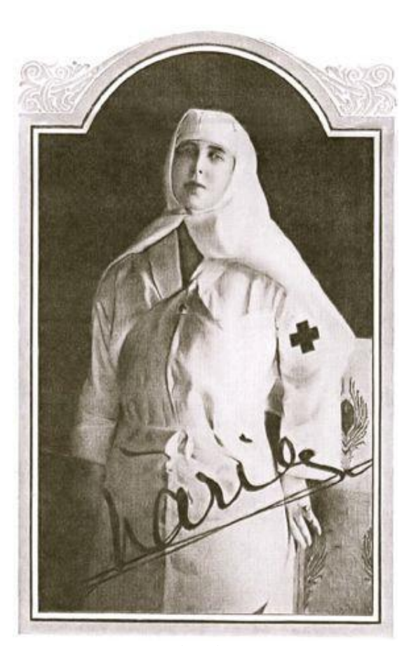
Fig. 1: Postcard with Queen Mary as nurse, autographed. This kind of postcards was distributed personally by the queen to the injured soldiers.

Red Cross on her dress. In Fig. 1 we display one of these hand signed postcards (from a private collection).