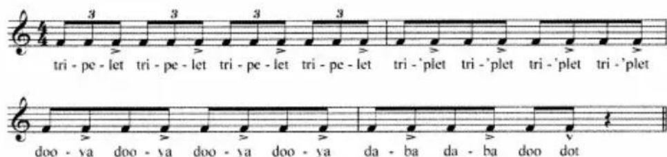
Fig.1. Example: four bars of a Swing pattern

One of the most prominent voice improvisers of the Swing era, Ella Fitzgerald, created intricate spontaneous intricate solos, whose rhythm, syllables and articulation are as closest to the sound of an instrument as there can be. One of her most acclaimed solos is the improvisation on „Oh, Lady Be Good”, as recorded with Bob Haggart and his orchestra in New York, March, 1947, a solo that contains quotes from her own composition „A Tisket, A Tasket” (1938) and that she continued to sing without changing one note or even one syllable throughout her career.