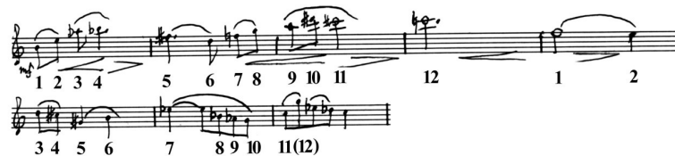
Fig. 7 Measures 24-27, oboe 1

The thematic conduct in A3 is originally