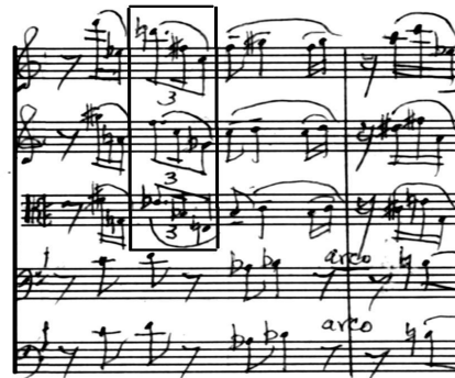
Fig. 3 measure 44, 1 st violin

violin) as well as in other opuses, but with a thematic role: in the octet Din isprăvile lui Păcală (Some of Păcală's Adventures) , and Sonata pentru flaut și pian (Sonata for the Flute and Piano)