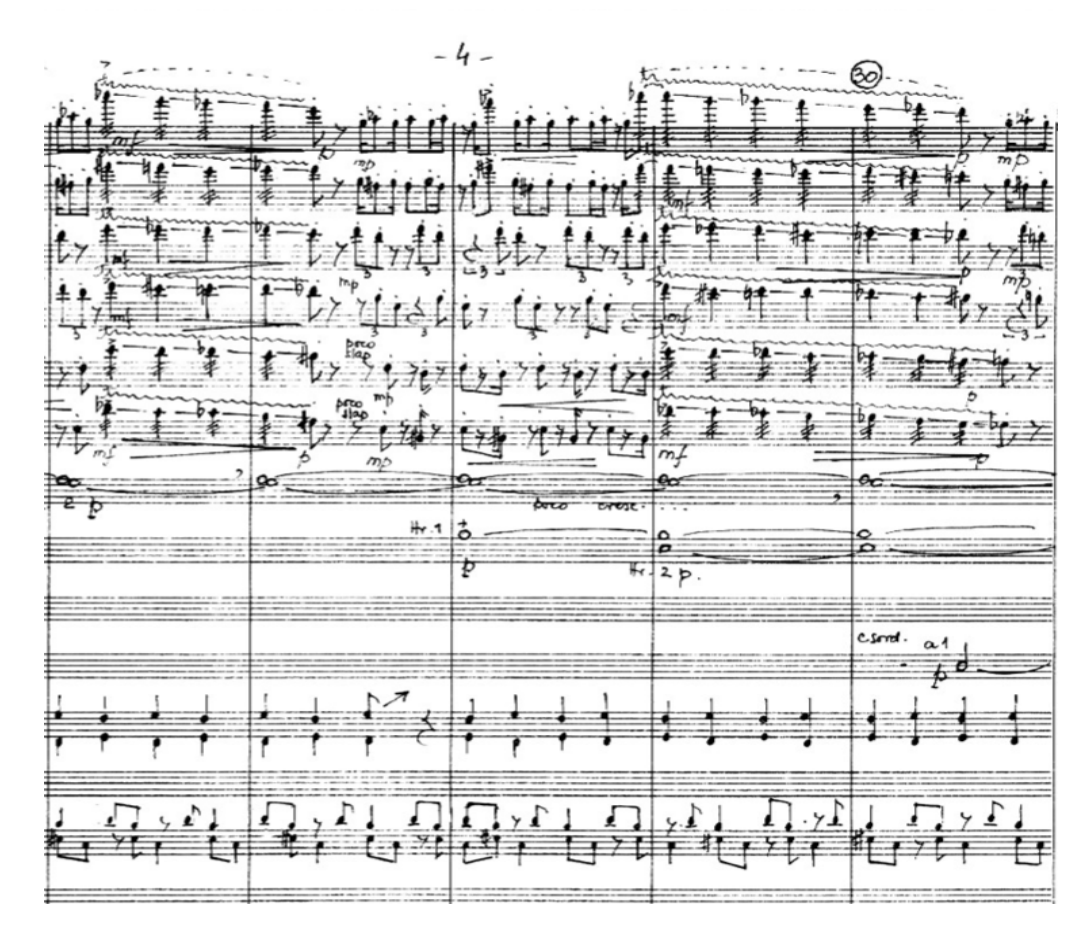
Fig.1- bars 26-30

In the second section, B (b.34-49), the slow flow of time through the hourglass and the distinct conquest of space are suggested by the previously mentioned descensio , but orchestrated in an exemplary way, with a different "functional" division between the wind instruments and the strings. Thus, from the flow in the high register to the low register, we can distinguish two well-defined textures.