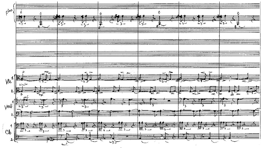
Fig. 5. bars 129-134

It is interesting to note that the violas act as a link between these two extremes, because the pulsation is created through accents rather than pauses .