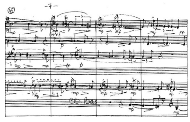
Fig. 3. bars 45-48

Heterophony and polyphony in an incipient stage among the wind instruments, where from the play around a sound and a second interval, a rudiment of melody is born through the addition of appoggiaturas. These appoggiaturas are not placed around the sounds they are attached to, but much farther in space. They are the ones that, through their diverse intervals, suggest a melodic path.