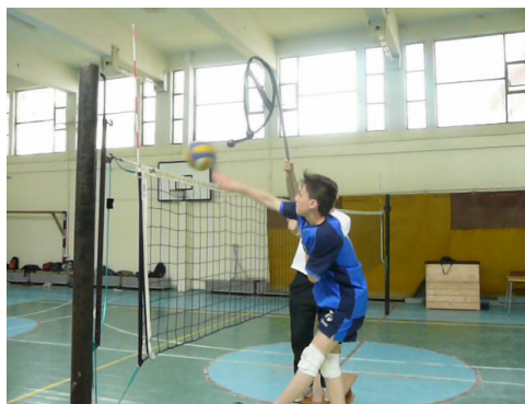
Fig. 1. Auxiliary device “framework for attack”

In order to achieve a timely movement to the ball and steps and then matching pace of implementation, we used the device helper “framework for attack”, figure 1., device that provides an approximation of the execution of purpose followed, guiding the subject in the recurrence with the object at the desired height, the ball sitting at the optimal point for hit.