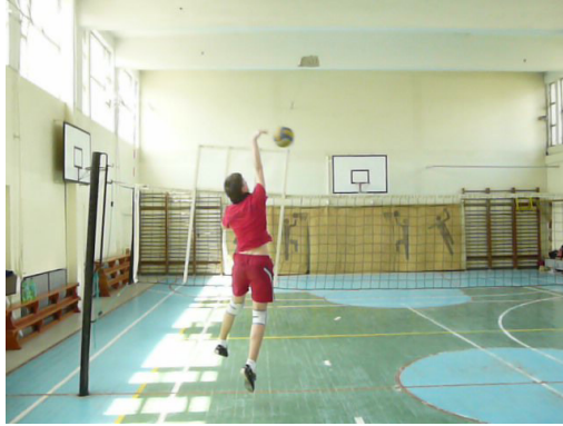
Fig. 2. Auxiliary device "Fixed Blockage"

Analyzing the values obtained from both groups at final testing process „spiking in the direction of momentum” we can see that the control group made an average of ( x = 2.81 ) errors of execution as opposed to the experimental group which received only ( x=1.84 ), the difference of 0.97 for control group, confirming that the experimental group made significant progress. Thus reducing technical errors from 146 to 94 supports the stated above, the phases of the process where they made the most progress was “hitting the ball”