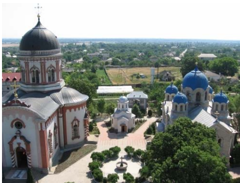
Fig. 1. Noul Neamţ Monastery

A considerable number of manuscripts of the monastery have been drawn up in the second half of the 19 th century, in a time when the tradition of writing manuscripts was on the brink of disappearance in Moldova, due to the emergence of the printing paper.