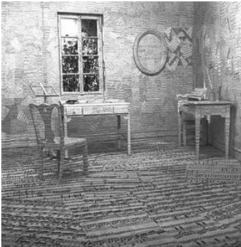
Fig. 2. Ludwig Van (1970) film by Mauricio Kagel

The musical work appears in a special historical and social context which regards the attitude towards tradition, the anti-authoritarian movement of the 1960s and 1970s, and its impact on avant-garde composers, Beethoven being considered a symbol of the past. Indeterminacy and experimentalism were two of the tendencies which Kagel combined in his creations: the indeterminacy of the musical score raises special difficulties in its interpretations (it is not only a propagator of the initial message of the composition, but also a factor determining the quality and the content of the message itself).