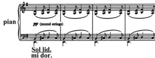
Fig. 5. Measures 5-8, orchestra in reduction for piano

The expressive preparation which the melodic launch achieved into The Cadence is thematically seized in the appearance of the theme A_1 (measures 5-15), in the exposure of the soloist instrument, of wide breathing similar to the lark's flight in the high sky. The serene, shining playing of the solo violin stands distinctly above the orchestral support, in the manner of the first two measures with which the piece begins, in a double layering Lydian G/ Dorian E . And here the fauxbourdon technique is extremely useful to produce the repetitive beating of a repetitive background-motif (measure 4), discretely played, in pianissimo acords: