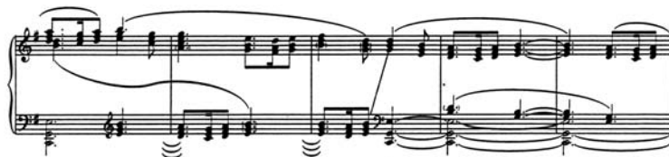
Fig. 17. Measures 236-240, orchestra in reduction for piano

of reasons sung by the violin. The last thematic appearance A_{1V2} - a short thematic conclusion of A segment - is achieved by the orchestra, in an imitative way, in stretto , on two sonorous layers twofold sound (brass / string players), the violin retreating after the exposure of the emblem-cell in the first two measures of the thematic moment: