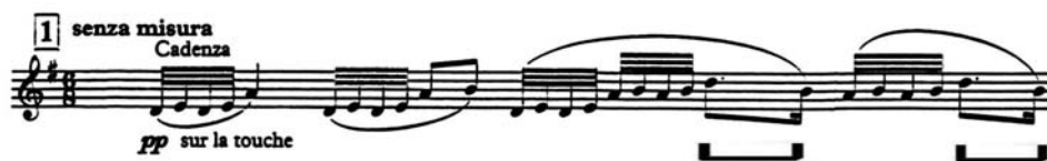
Fig. 2. Measure 3, soloistic cadence

Another structural element of The Cadence , of great importance, in addition to the intonational relation repeated every second - mentioned above - is the descendant interval of of small third, both cellular forms being of high importance for the thematic and figurative construction of the piece: