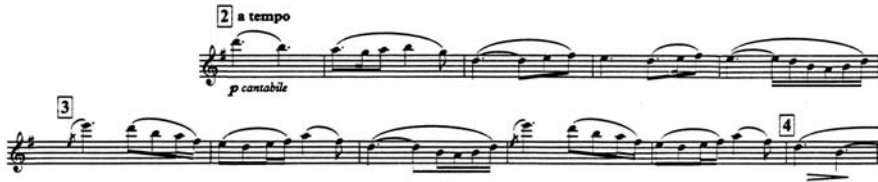
Fig. 7. Measures 5-15, solo violin

The presence of pentatonism scales in the melodic line, alongside with the conconflictual, tensionless harmony without tension, gives the first theme the expression of the remote flight at high height, lyrical and meditative in nature: