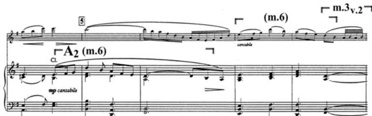
Fig. 8. Measures 21-24, solo violin and the piano

A quick transition facilitates the second theme - A_2 (measures 21-24), its exposure being divided between clarinet I solo and violin, each of the two instruments taking the constitutive motif of the theme (measure 6):