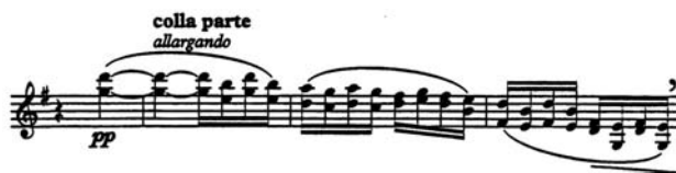
Fig. 16. Measures 181-184, violin

The real retransition develops between the measures 181-196, and it reappears as an accompanied cadenza , the cell input ”v” and ”y” being exposed similarly to a mixture by the soloist, against the acordic E background as a multiple orchestra pedal: