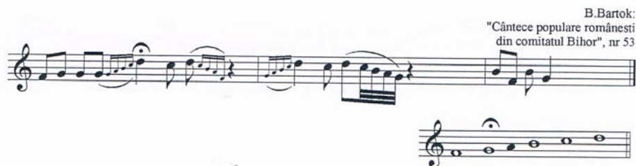
Fig.5. Hemitonic mode I

The hemitonic mode I – also called the Bihor scale FA-SOL-SI-DO-RE: