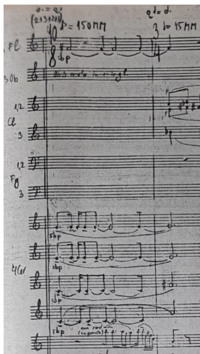
Example 3. Nicolae Teodoreanu – The ages of time for orchestra, measure 251

"Ethnomusicology is seen as the study of people making music. People make sounds they call music, and they also make ideas about music (...): they include what music is and is not; what it does and cannot do; how it is acquired and how it