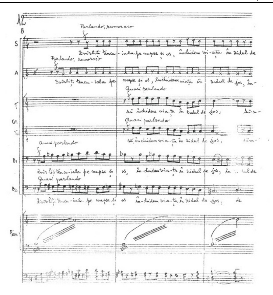
Fig. 2. Sigismund Toduţă – Master Manole, Act III, p. 176