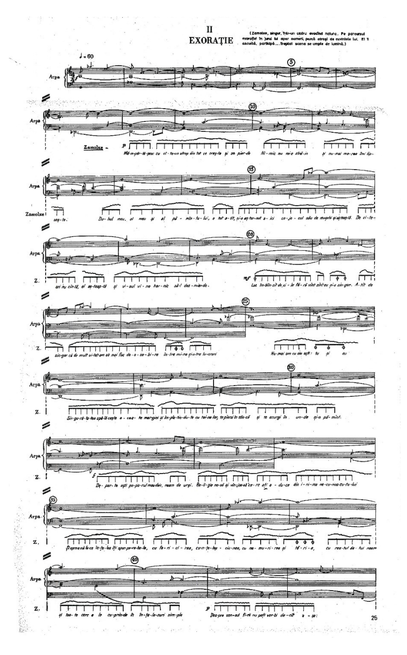
Fig. 5. Liviu Glodeanu – Zamolxis, Act II, p. 25