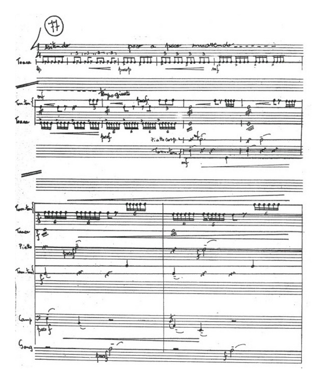
Fig. 3. Sigismund Toduţă – Master Manole, Act III, p. 214