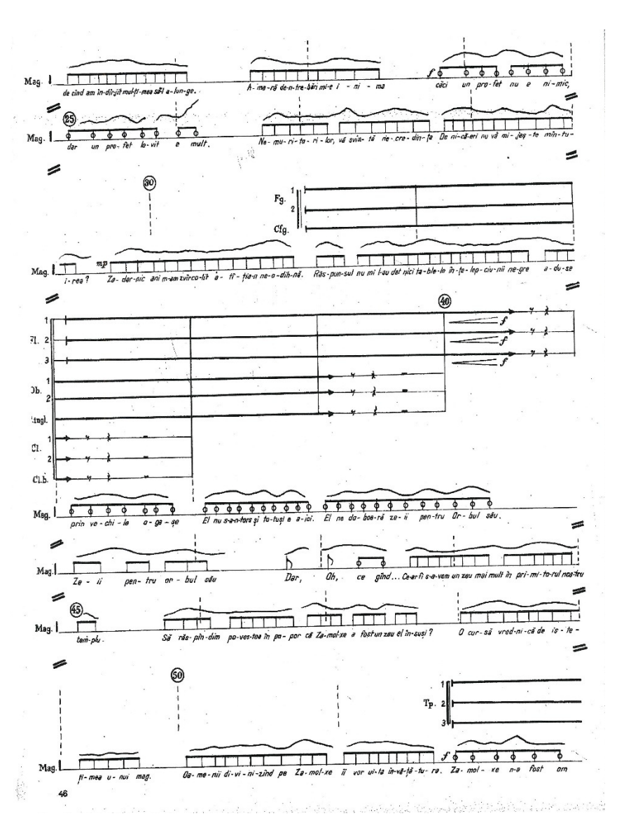
Fig. 7. Liviu Glodeanu – Zamolxis, Act IV, p. 46