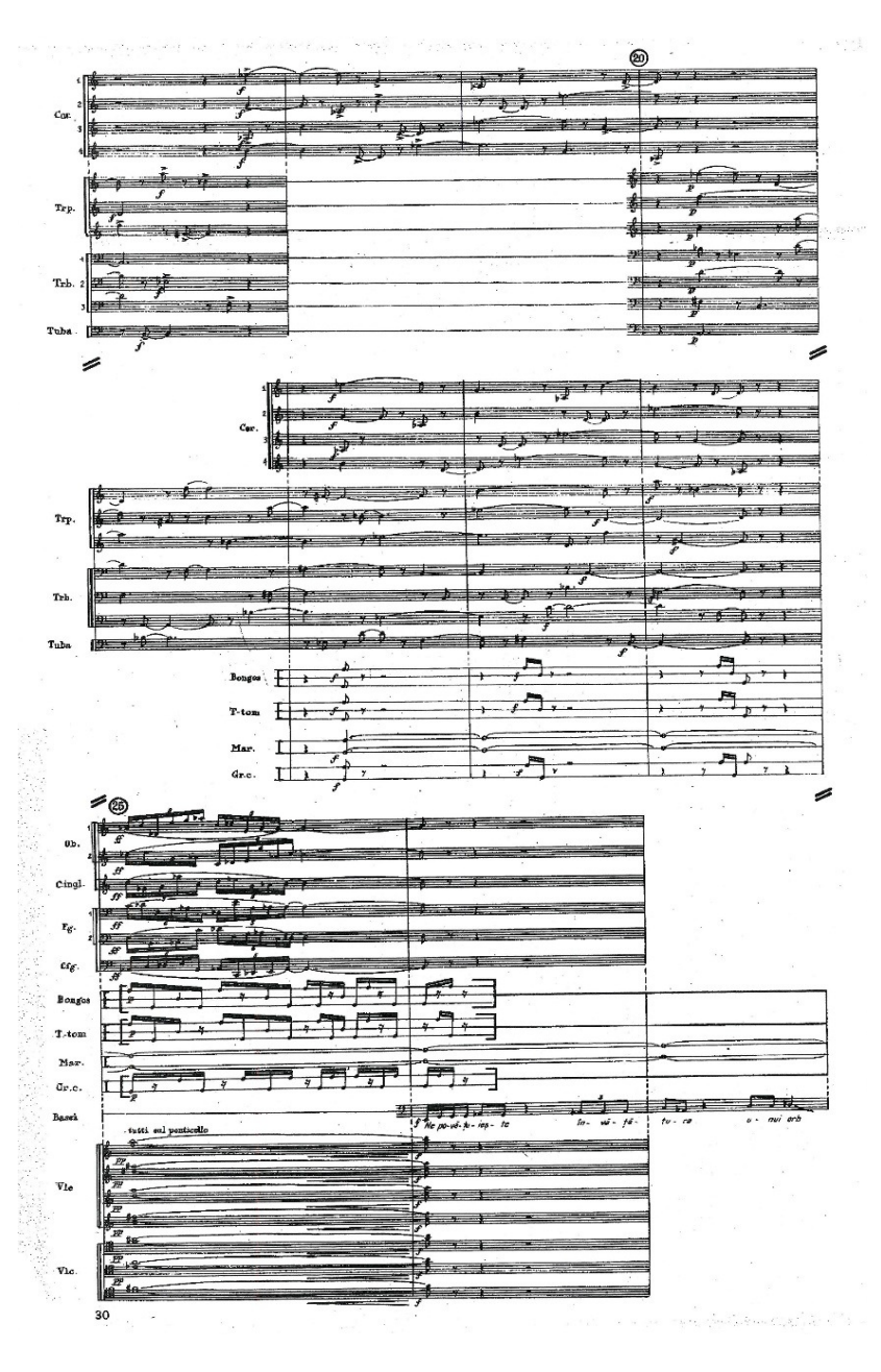
Fig. 6. Liviu Glodeanu – Zamolxis, Act III, p. 30