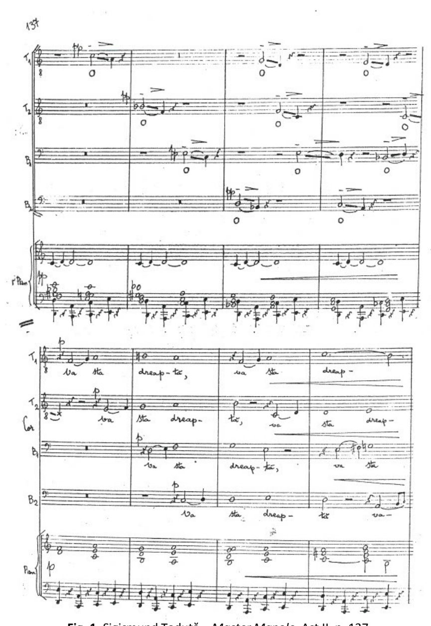
Fig. 1. Sigismund Toduţă – Master Manole, Act II, p. 137