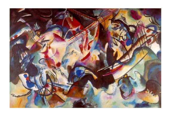
Fig. 4. Kandinski – "Composition VI"

For instance, in Composition VI , "a seemingly indecipherable vortex of shapes and colours, diagonal movements, bright and muted colours, extremes of light and dark, areas of thinner and thicker paint" (Graham-Dixon 2008, 438) on a red-blue, somehow discordant, harsh background (Duchting 1991, 38), one can apprehend the painter's synesthetic experience and the way Schoenberg understands dissonance and rich chromaticism.