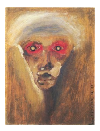
Fig. 1. Arnold Schoenberg's "Red Gaze", 1910. [Oil on pasteboard, 32 x 25 cm]. May 1910. Municipal Gallery in the Lenbachhaus, Munich.