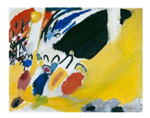
Fig. 3. Kandinsky. "Impression III" (Concert)