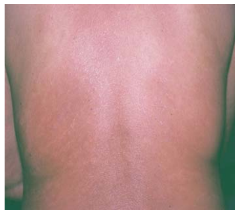
Fig. 3. After 16 weeks with Methotrexate and SUP

The biopsy was not necessary for the patients of the studied groups, because treatment was done for short periods of time with low doses of methotrexate.