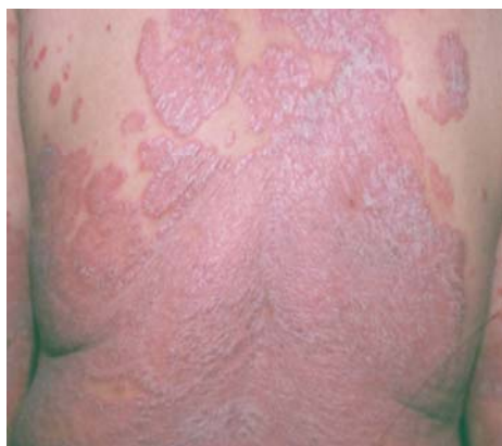
Fig. 2. Before treatment

methotrexate [10]. For patients following a long-term methotrexate therapy, the liver changes should be highlighted through a liver biopsy.