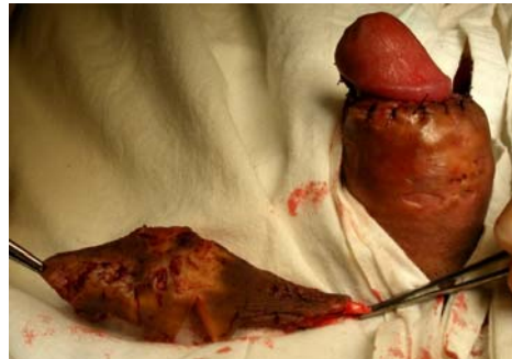
Fig. 4. Postoperative appearance