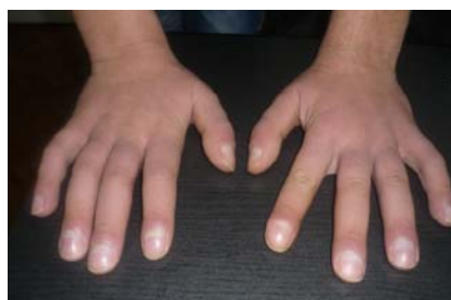
Fig. 2. Pachydermoperiostosis: thickening of the skin on dorsum of the hands

On examination of osteoarticular system finger clubbing, tibiotarsal joints swelling were noted. It should be noted that patient's mother and sister also presented with blepharoptosis but in the absence of other manifestations of PDP.