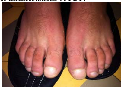
Fig. 3. Pachydermoperiostosis: thickening of the skin on feet

On examination of osteoarticular system finger clubbing, tibiotarsal joints swelling were noted. It should be noted that patient's mother and sister also presented with blepharoptosis but in the absence of other manifestations of PDP.