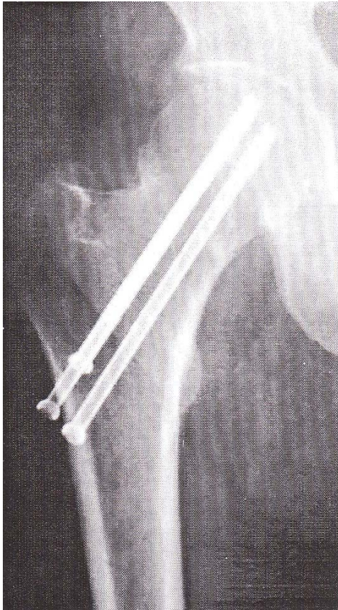
Fig.1. Osteosynthesis with screws

whether s/he is capable or strictly obeying the doctor's indications for the post-surgical period.