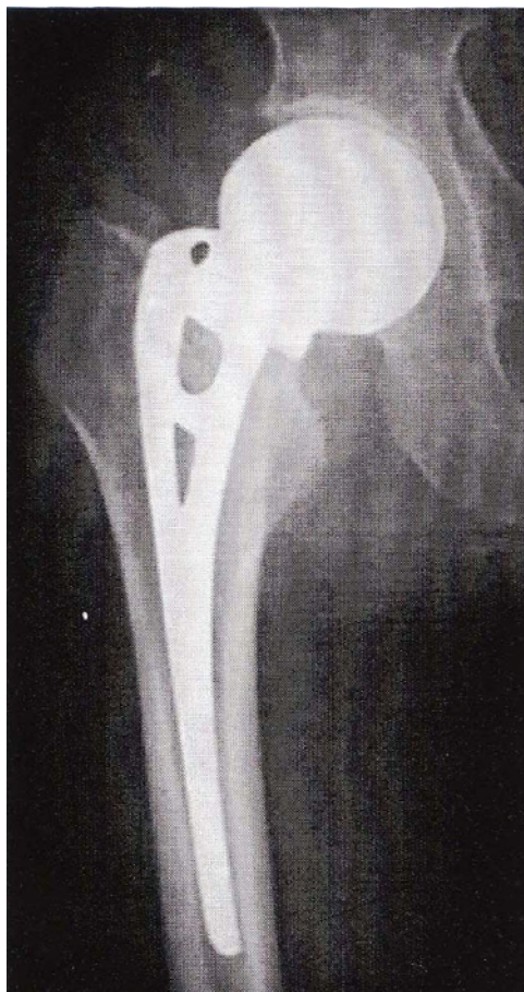
Fig. 3. Hemiarthroplasty

- by making the pain disappear, it has an extremely positive psychic effect on the patient; at the same time, it makes the activity of tending the patient much easier [7].