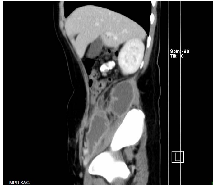
Fig. 3. CT scan with contrast, sagittal view, showing a gross loculated retroperitoneal collection in the right flank. The mass comes in contact with the iliopsoas muscle while extending cephalad to the inferior pole of the kidney and caudal to the deep inguinal ring.