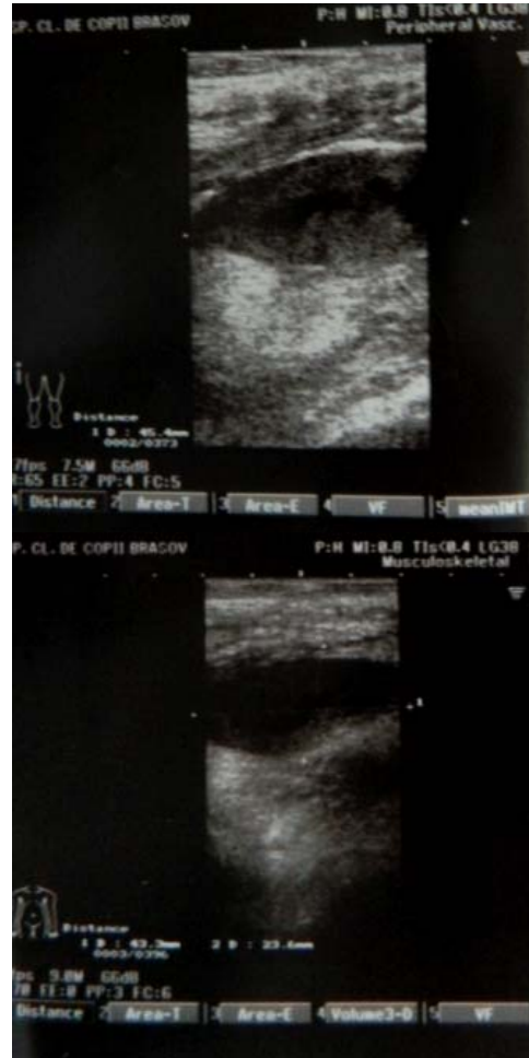
Fig. 1. Abdominal ultrasonography showing a collection in the right lower quadrant

The abdominal ultrasound scan revealed a hypo-echogenic intra-abdominal mass of 4 cm in diameter, situated 2 cm deep in the right iliac fossa, containing un-homogenous fluid (Figure 1) and absence of free fluid in the peritoneal cavity. Both kidneys presented enhanced reflectivity and showed no kidney pelvis dilation.