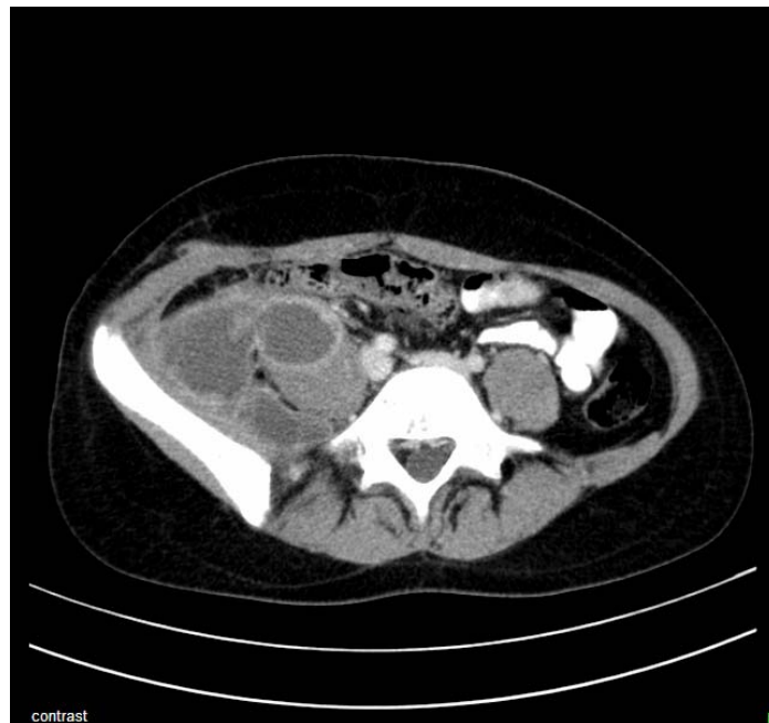
Fig. 4. CT scan with contrast, transversal view, showing a gross loculated retroperitoneal collection in the right flank, coming in contact with the iliopsoas muscle which is swollen.