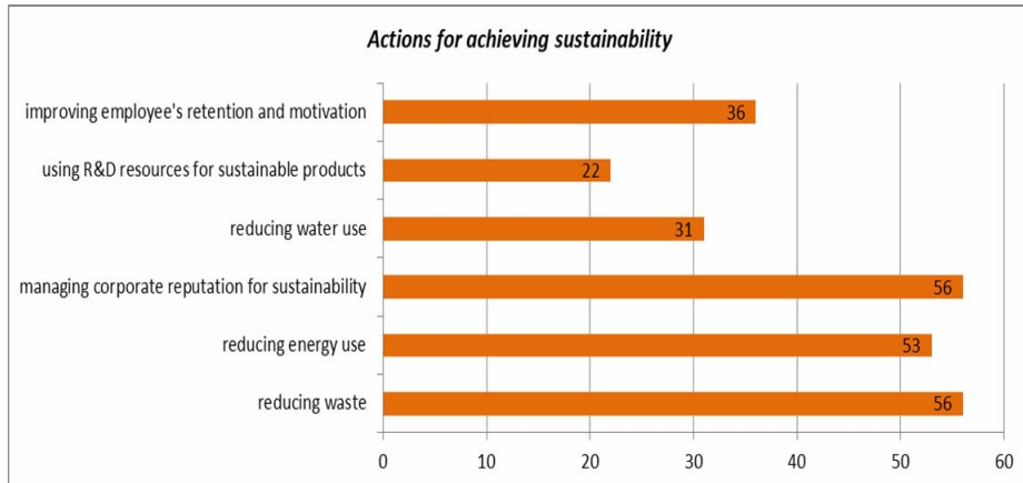
Fig.1. The main company's actions developed for achieving sustainability

Companies are integrating sustainability across many processes, according to respondents, but mostly in: mission and values (65%), operations (62%), marketing (59%), external communications (58%). All the results are shown in the following figure.