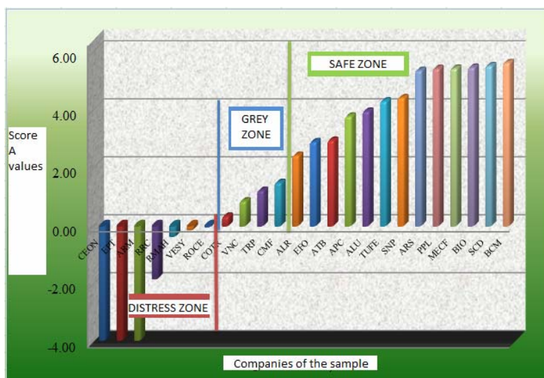
Fig. 2. Classification of companies according to A score obtained

The results obtained in the sample, during the three years considered and their classification for assessing the risk of bankruptcy can be seen in Figure 2 below.