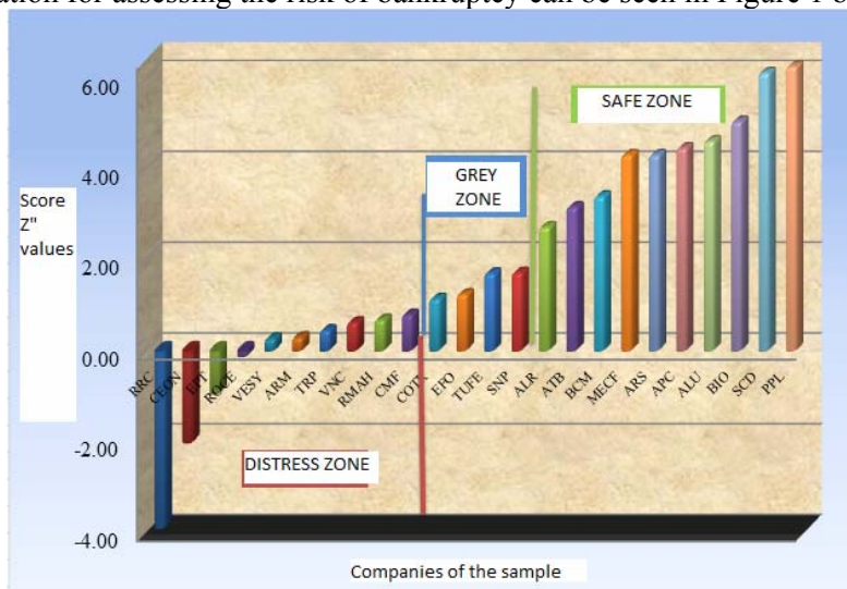
Fig. 1. Classification of companies according to Z score obtained

The results obtained in the sample, during the three years considered and their classification for assessing the risk of bankruptcy can be seen in Figure 1 below.