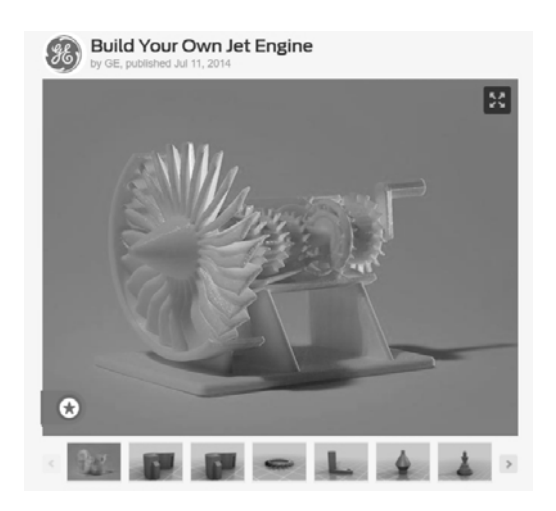
Fig. 2. Build Your Own Engine (GE 2014)

In a similar manner, BMW promoted the products of the brand through an 8 parts mini-series, staring Hollywood star Clive Owen, in which an important part was played by the company cars. Each part was enjoyed by more than 2,5 million viewers, resulting in a very efficient exposure with positive consequences for the brand