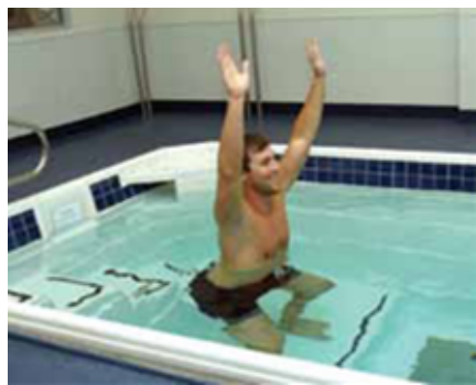
Fig. 2. Exercises for glutes, a

Increased dosage and speed. Hands are used to stabilize the front. Forward and backward along the pool (a). Start with small steps and gradually increase the speed and grow.