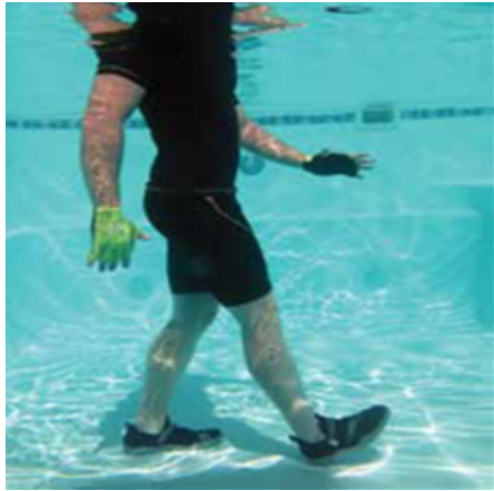
Fig. 1. Warming (3-5 minutes)

Objective: To adjust the buoyancy to heat and water and the body. Wearing gloves, begins with a slow running or marching in place.