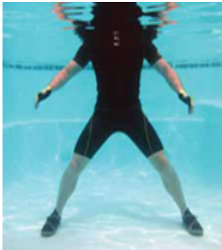
Fig. 6. Hip abduction and adduction, b