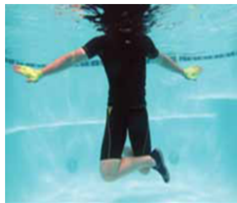
Fig. 8. Hip flexion

Strengthening: Start with feet apart (a) and knees putting together b) of the hip adductor muscles on such. Keep the size and speed of movement in the year and increase as tolerated by the patient. c) Abduction and adduction of the hip: freewheel [9].