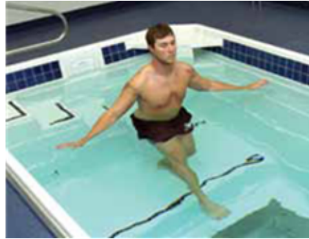
Fig. 3. Exercises for glutes, b

Hands are kept above water for stability and balance. Double-leg squats lower in shallow water or on a step. Check posture with ears, shoulders and hips aligned. [8].