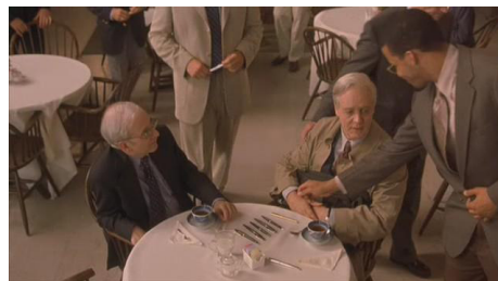
Fig. 5. The pen ceremony