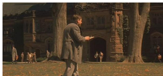
Fig. 2 Russell Crowe as John Forbes Nash, Jr. in A Beautiful Mind.

If the discursive psychology is applied to the conversational turns, the social action that John promotes is his intention to find an algorithm to define the pigeons’ movement; it is the world that Nash constructs for himself in order to find the original idea. His reply makes his colleagues label him as psycho ; the university courtyard where John analyses the pigeons represents the location where he develops his occupational identity. Figure 2 illustrates the movie picture including the setting representative for the above interaction and it also illustrates the public distance Nash exerts towards his colleagues that he treats as complete strangers.