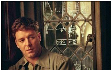
Fig. 4. Russell Crowe as John Forbes Nash, Jr. in A Beautiful Mind

Applying discursive psychology and a semiotic approach to the above extract, it represents a conversation between John and his self, a sign of introversion. As Figure 4 illustrates, John invented the window art; space becomes a topic of discussion, as the character uses the library’s windows for his mathematics analysis.