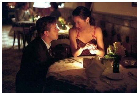
Fig. 3. Russell Crowe and Jennifer Connelly in A Beautiful Mind.