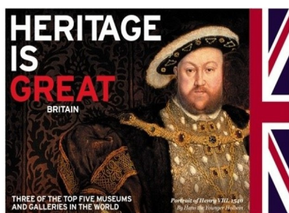
Heritage is Great Britain. Three of the top five museums and galleries in the world.

Another ironic strategy is adopted by the authors of the adverts in The Huffington Post . Aware of the fact that “any adverts focussing on denigrating Britain would also have to counteract the £500,000 spent on convincing people to come to Britain ahead of the Olympics” (‘Anti-British Ads’ Could Target Immigrants From Romania And Bulgaria, in Huffington Post ), the journalists mirror the original posters (example 7) with the anti-British posters (examples 8 and 9), in an ironic manner, based on both intertextuality and resemblance of the images. (7) 5