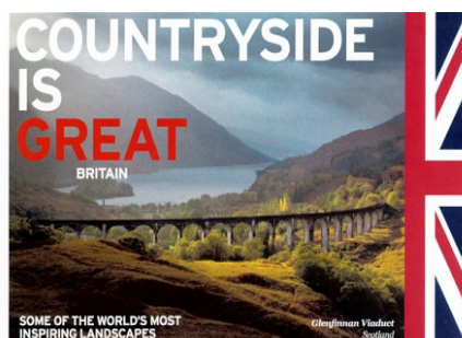
Countryside is Great Britain. Some of the world's most inspiring landscapes.

The Great Britain campaign encouraged people to visit the United Kingdom, while the anti-British campaign of the Church Action on Poverty brought out their new version of the ad.