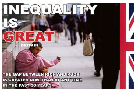
The gap between rich and poor is greater now than at any time in the past 50 years.

The irony of the situation is given by the contradicting discursive movements. Though intended to foreigners wishing to emigrate to the United Kingdom, the anti-British campaign used self-irony and self-pity to portrait the country in a less-