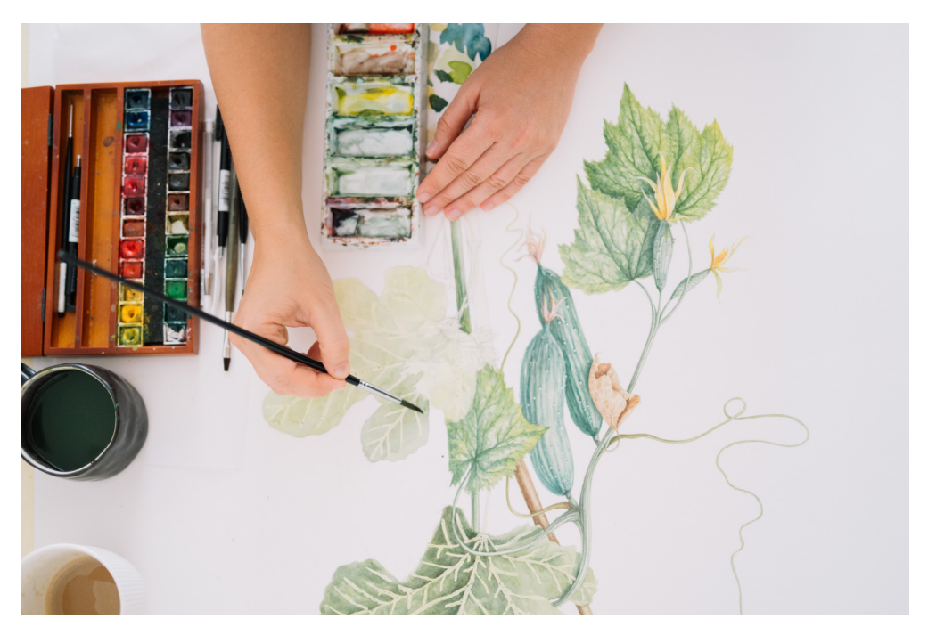
Figure 3. Botanical art studio, 2021.

writers and planners; botany may serve environmental planners, as it serves painters; while all of them should know how to handle online presence, social media identity, marketing, and nevertheless to carry their offline and online practice through a multitude of media that could only reveal the potential complexity of the projects. No good project could stand the test of time if it ignores the wider-than-never community we are all part of through mobility and globalization, and this includes awareness of both cultural and natural realm, an environment that we should stress to keep in balance.