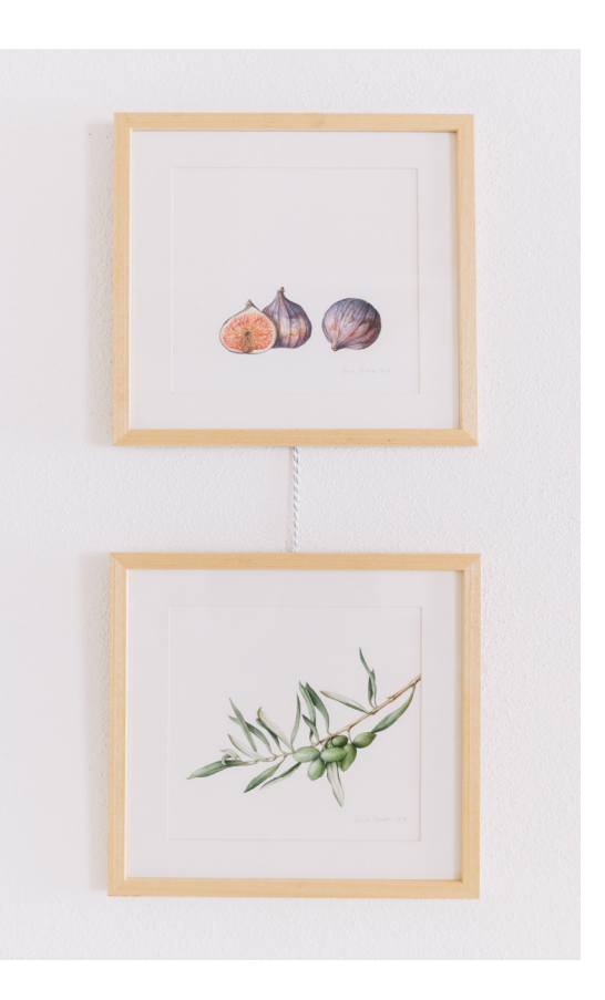
Figure 2. Botanical art studio, 2021.

awareness, which calls for interest in scientific research and support, which leads to new cultural perspectives. We witnessed the way artistic documentation of the newly discovered western mountainous landscape in Northern America. in the 19<sup>th</sup> century, generated an enormous body of work among Romantic painters, a reverie that eventually led the to establishment of the first national parks and of what we could now call proto-environmental а movement. It was also then when mountaineering brought new fashions in gardening, such as the Victorian rock gardens, an era of massive botanical art production related to all these novelties. Change, as a general topic, has been always vividly circulating among practitioners in all these domains, culture, science and environment. Weather to adapt or to resist, might only find