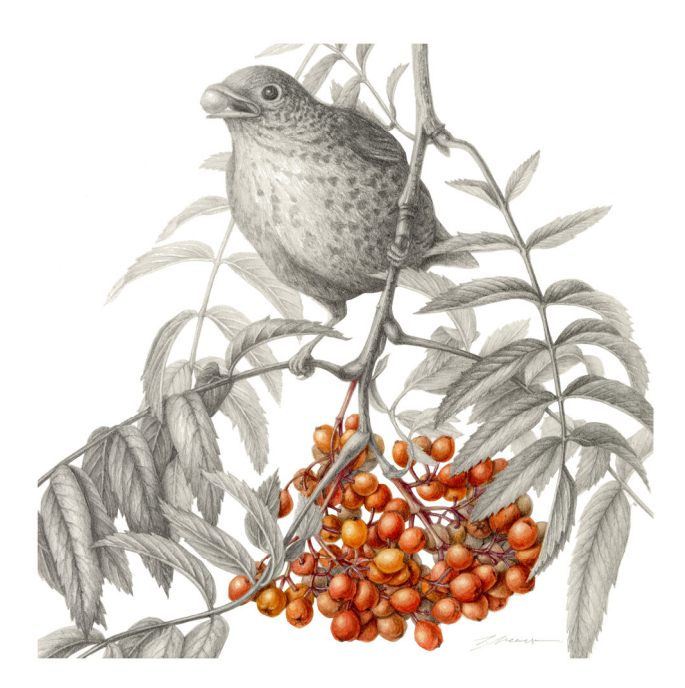
Figure 1. Sorbus, artist Irina Neacșu, people's choice award at the ASBA "Small Works" exhibition at the ASBA annual conference, New York, 2022. Credit: Irina Neacșu

employing scientific abilities, this becomes its voice in advocating for contemporary realities of the plant realm. Botanical art is nevertheless clear, descriptive, true to nature and carefully designed to express the complexity of the plant. But the particular mixes of techniques, the thoughtful compositions and the subtitle emphasises laid over core subjects of the depiction could easily set such work at the limit between scientific illustration and modern minimal art.