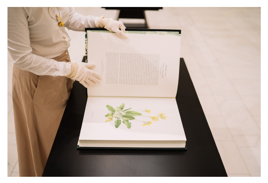
Figure 5. Transylvania Florilegium, photo taken at the Bucharest National Museum of Art during the book launch event, 2019.

The Transylvania Florilegium is a two volume large size book recording the flora of Transylvania. Published by Addison Publications in 2018, it was the initiative of HRH the Prince of Wales, now HM King Charles III, who also has written the preface, hand signed on each book. Drawing attention on the precious wild flora of what is called to be the last medieval landscape in Europe has been the six-year project of producing 124 botanical illustrations with a team formed by some of the finest botanical artists of the moment. Curated by Helen Allen FLS, artist and Principal of the School of Botanical Art at the Chelsea Physic Garden, the Transylvania Florilegium benefits from the comprehensive information written by botanist Dr. John Akeroyd FLS, who has been working on Transylvanian flora for over fifteen years. The 36 artists crafted these botanical illustrations in watercolour on paper mainly in the two locations where HM has his properties: the Saxon village of Viscri and the more remote village of Zalanptak.