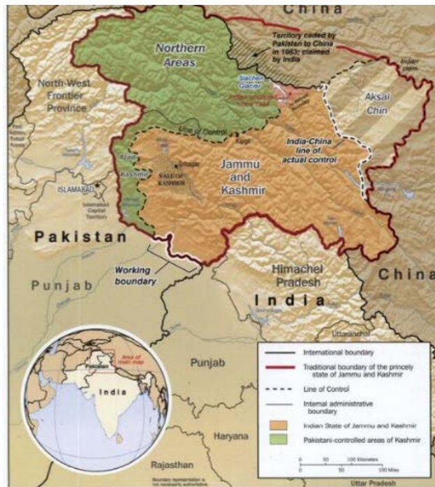
Figure 2. The disputed area of Kashmir (Washington: Central Intelligence Agency, 2002), Library of Congress Geography and Map Division Washington, D.C. 20540-4650 USA dcu.

Today, Google Maps will only show the state-mandated borders when accessed from within the country; its maps of India accessed from outside the country represent the conflicted areas in dotted lines.