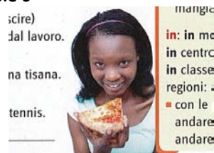
Table 3. FL textbooks for Italian. Some examples of representation of non-Ws

However, the statistical data about official migration rates to Italy (Eurostat, data from 2016) reports 0.5% of the population to be Ws and non-Ws immigrants, which is (surprisingly) low compared to the vivid impression about the reality in many Italian cities. Anyone who spends some time in Italy will get the impression that, in the last decade, in some areas of Italy the non-W persons, legal or supposedly illegal immigrants, are highly present, sometimes this being perceived as outnumbering the local inhabitants in some neighbourhoods.