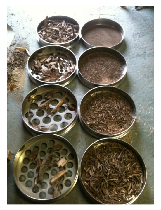
Fig. 1. Sieves used in fractioning out the particle sizes of the hogfuel

*At the 95 % confidence level. AR = As Received