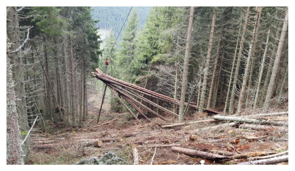
Fig. 1. A typical snapshot of yarding pre-bunched stems

The yarder used was a standard Wyssen W30 equipped with a 4-ton radiocontrolled clamping HY4 carriage mounted on a 26-mm skyline and pulled by a 11-mm mainline. The yarder was setup in a downhill gravitational configuration, with the sledge placed uphill.