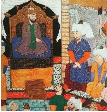
Fig. 10. The Shahnama of Firdausi, Gilan, Iran, British Museum. This miniature shows the presence of the Chinese dragon motif as a furniture decoration in the miniature even before the Shahnama of Shah Tahmasb

In the early Safavid period, design patterns were mostly composed of single and repeated motifs, which frequently exhibited geometric patterns (Figures 5 to 8). Design motifs also combined mathematical and geometric rules, such as the golden ratio taken from the West. From the commencement of the natural and floral motif, another pattern found its way into court furniture decoration. This was developing in the 16 th century when “human figures and animals” made their appearance in Persian art. Extant examples among Iran and China in the early Safavid period are single symbols, such as the ‘broken cross’ (Figure 5), Swastika form that is also present in Chinese rugs and furniture), ‘eight-pointed star’, and abstract flowers. Later, from Shah Tahmasb miniatures, repeated single patterns are seen in many of the handcrafts (Figure 6 to 8). There are three forms of ornaments illustrated in the miniatures: 1. Islamic pattern (framed