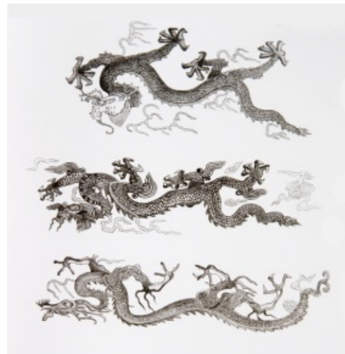
Fig. 17. The Dragon motif, Yuan dynasty, this motif has been seen in Shahnama's miniatures [24]

Although the dragon motif positioning in Chinese and Iranian art is different, the Persian artists observed their tradition, yet were inspired to use it as a positive design motif. For instance, Shahnama miniatures mostly visualized the Dragon figure (Figure 18) as a symbol of evil and vindication [4], however on occasions, it followed the influence of Mongolian art which alluded to the bold king's social status (as used in the Chinese style) and placed in a dominant position, such as the top rail and crest rail on furniture (Figure 10), or in the lower part of kings' thrones, providing structural stability as in the leg support (Figure 5) [13].