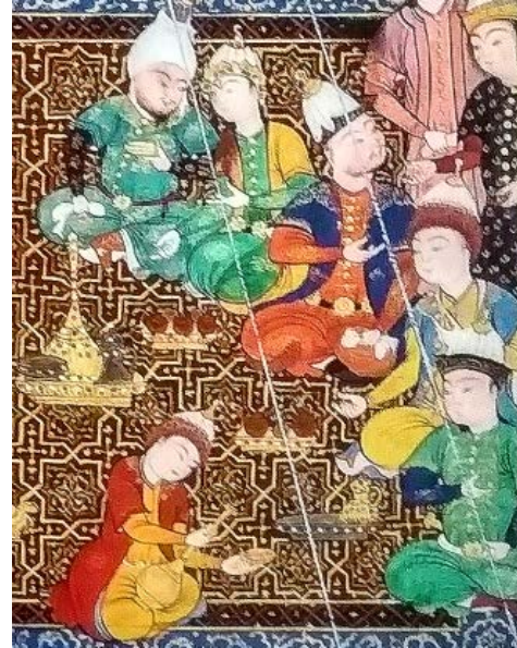
Fig. 23. Chinese knot on the Persian rug, Shahnama of Shah Tahmasb