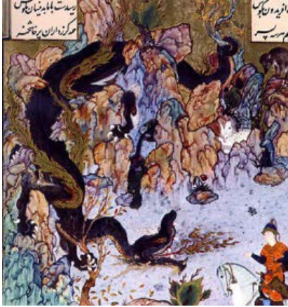
Fig. 18. Similar Dragon as Yuan dynasty presented in the Shahnama of Shah Tahmasb [5]