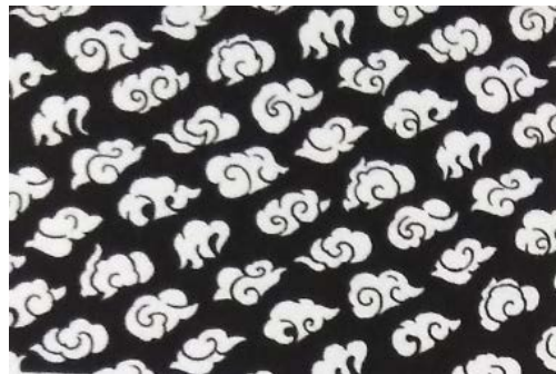
Fig. 2. Chinese cloud designed on fabric, the early 8 th century Hijri (Islam) [15-16]

the original items (imported through established trade) were still acceptable as high art for Shah Ismail and his son. These Chinese goods illustrated the elements of Far East decorative designs which were also found on the silk fabrics attributed to Iran [15] (Figure 2).