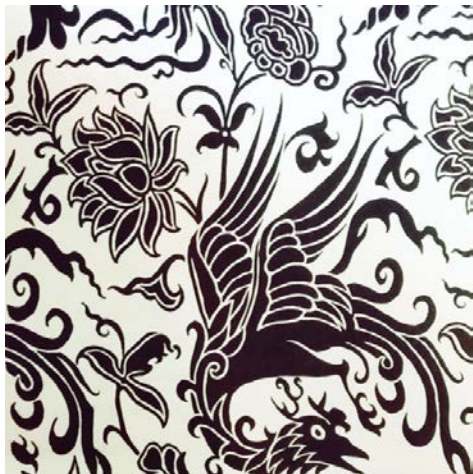
Fig. 4. Phoenix designed on fabric, around 6 th to 7 th century Hijri (Islam) [15-16]

Chinese blue and white ceramics which appealed to the Safavid king were introduced to Iran in the second half of the 14 th century, which influenced tile design work during the following centuries [3]. These designs borrowed the prized handicrafts style that represented Chinese floral and animal motifs. Later, the Silk Road expanded Persia's economy through trades over the course of the 16 th and 17 th century [3]. Some of the patterns copied from Chinese dishes depict potted plants and Chinese peony blossom (Figure 1) with the stylized cloud (Figure 2), also animals such as the dragon (Figure 3) and the phoenix (Figure 4) are depicted which later is seen in the Safavid decorative elements palate [9].