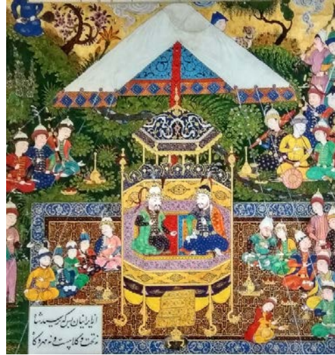
Fig. 5. The Shahnama of Shah Tahmasb. The picture shows Piran and the Khaqan of China. Museum of Contemporary Art, Tehran, Iran. Many Chinese motifs presented in this picture could be because of the presence of Khaqan. The Swastika, the Chinese cloud, framed motifs, and the dragon figure. The throne structure presents the Chinese canopy bed style

The origin of design flows from an artist’s mind [11], which of course is influenced by their individual context; nature, people, lifestyle and later consumer growth, which result in more complex designs being produced over time.