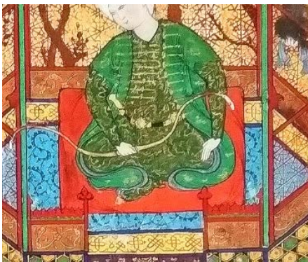
Fig. 13. Cloud bands and Chinese knot decorated Persian wooden furniture and carpets presented in Shahnameh of Shah Tahmasb