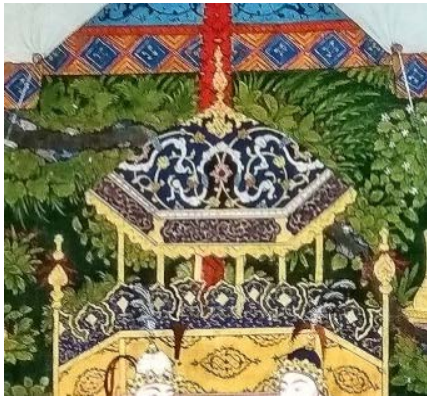
Fig. 12. Cloud band applied to a throne (Chinese canopy style) of Shahnamah of Shah Tahmasb