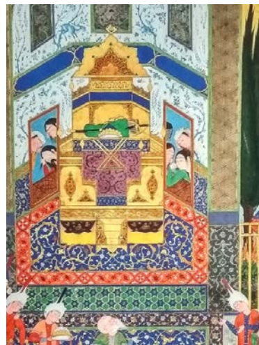
Fig. 9. A page of the Shahnama of Shah Tahmasb, Tehran Museum of Contemporary Art, attributed to Sultan Muhammad and Abd al- Aziz. A huge throne with a Chinese style folding chair designed with a floral pattern and framed motifs