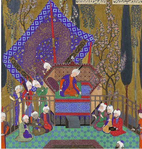
Fig. 6. A page of the Shahnama of Shah Tahmasb, Chinese day bed style for the king's outdoor throne using the phoenix, and Chinese cloud bands to decorate this throne