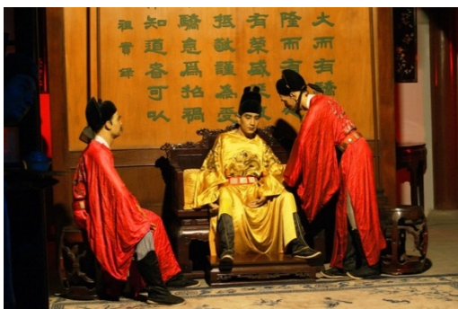
Fig. 25. A throne with three sides, Ming dynasty. Similar forms are shown in Figures 6, 7, 9 and 10 [23]

However, the Couch bed presented in the Chinese style is wider than what is represented in the Shahnama miniatures, where it is designed for one person (not royalty, but other high-level authorities) to sit on (Figure 19). There is also a developed Chinese couch bed in the shape of a throne (Figure 25), which is explicitly designed for kings. This furniture has three sides with a much higher backrest, as seen in the miniatures, where it is complemented with a stool in front of the bed (Figures 6, 7 and 9).