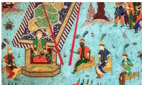
Fig. 7. A page of the Shahnama of Shah Tahmasb, Tehran Museum of Contemporary Art. Significant copies of Chinese wooden beds are presented in the thrones and chairs in Shahnama of Shah Tahmasb. Canopy beds and couch beds with three sides with higher back support and four chairs in the shape of Chinese "Rose chair" are the most copied ones