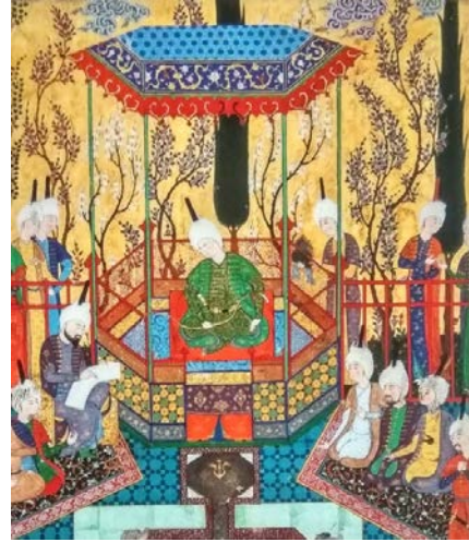
Fig. 8. Zal and the throne , The Shahnama of Shah Tahmasb, Tehran Museum of Contemporary Art, attributed to Sultan Muhammad and Abd al- Aziz. There are motifs of Chinese Knot and Chinese clouds, as it is shown in the picture, applied to the wooden furniture and carpets. However, the use of this pattern in court furniture reminds viewers of Chinese canopy beds