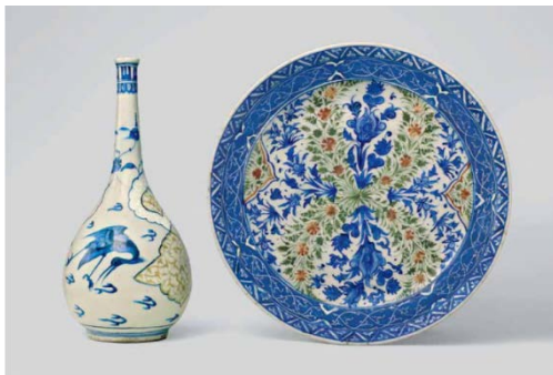
Fig. 1. Dish, Iran, Kirman, Edward C. Moore Collection, 1981. Bottle, Iran, Kirman, Rogers's fund, based on Buddhist vessel that was introduced into China, 1914

Chinese blue-and-white porcelain may be considered as the initial emergence of Chinese patterns into Iran's decorative design. This had a long-lasting impact on Iranian taste and influenced the Persian economy from the early Ming period (15 th century). The success of its market value influenced some artists to manufacture profitable copies in the Middle East (Figure 1).