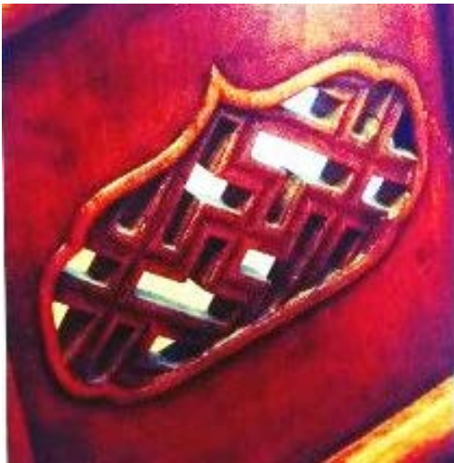
Fig. 16. Wanzi motif that was used to decorate tables and beds in China especially in the Ming dynasty [13]

The word “Wan” in Chinese tradition, rooted in the Buddhist culture, represents the harmony of life, and for the Chinese, it is a symbol of endless happiness, wealth and longevity [13]. In Iran however, the relation between the broken cross and its philosophy in Islamic art is not clear to researchers. On the other hand, in pre-Islamic history, this form is described as a sign for four directions, or four angels supervising four seasons. This pattern was used occasionally between Iranian periods with the latest examples being observed in Safavid architecture and art [18].