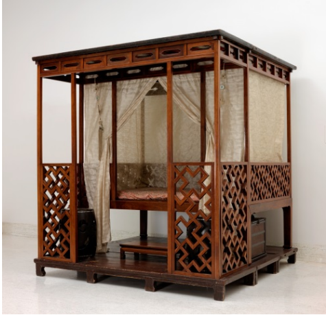
Fig. 24. 16 th century canopy bed with its wooden structure inspired Safavid painters to illustrate the outdoors beds for kings [23]

However, the Couch bed presented in the Chinese style is wider than what is represented in the Shahnama miniatures, where it is designed for one person (not royalty, but other high-level authorities) to sit on (Figure 19). There is also a developed Chinese couch bed in the shape of a throne (Figure 25), which is explicitly designed for kings. This furniture has three sides with a much higher backrest, as seen in the miniatures, where it is complemented with a stool in front of the bed (Figures 6, 7 and 9).