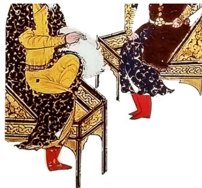
Fig. 15. Wanzi motif applied to a Chinese rose chair style presented in the Shahnameh of Shah Tahmasb in the Safavid period [5]

The Swastika, a form of two intersected lines, is a geometric pattern known in Iran (Figure 7) as the broken cross (or Chilipa in Persian) and as the Wanzi motif in China (Figure 16). Various discussions and ideas have been presented about its origins, symbolic meanings, and concept including its use on Mesopotamian coinage and spiritual significance (Hinduism, Buddhism, and Jainism). The version under study here shares some similarities with numerous different periods and is regarded auspiciously as a sign of luck and good health, normally framed within a curved perimeter [13].