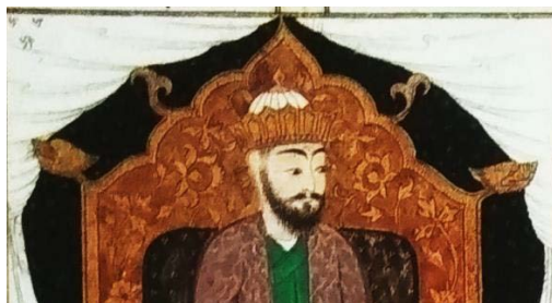
Fig. 20. Dragon head decorates the top rail. The Shahnama of Firdausi

The design of the dragon is mostly employed in Chinese carpets and pottery,