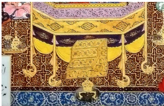
Fig. 19. Dragon motif used to decorate the legs of Shah's throne. Shahnama of Shah Tahmasb miniature