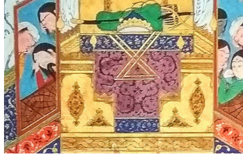
Fig. 14. Cloud bands used to design carpets as well as wooden furniture presented in Shahnameh of Shah Tahmasb