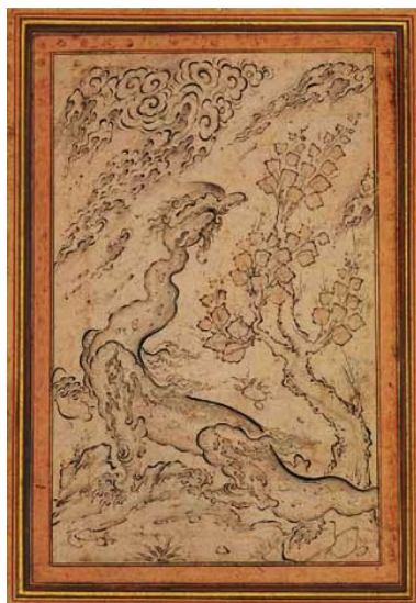
Fig. 3. Dragon and clouds, during late 16th and early 17th single pages of drawings, contained the image of the dragon [7]

Isfahan (1597-98). Isfahan city was a turning point for Safavid art and was surrounded with beautiful architecture, highly inspired by bold colors and motifs of the Iranian-Islamic style. He also invited Chinese potters to Iran to promote Chinese ceramics, and the invitation also encouraged the Chinese style in Iranian painting and miniatures [17] (Figure 3).