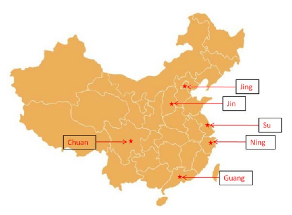
Fig. 1. Six important Qing furniture making centres

The furniture made in Suzhou ( Su for short) and in the surrounding area enjoys the highest artistic value. Suzhou was an economics, handicrafts, and overseas trade centre in ancient China, having a long history. In the Sui and Tang dynasty (581AD—907AD), due to the improvements in agricultural techniques, Suzhou became an important grain-producing area in China [13].