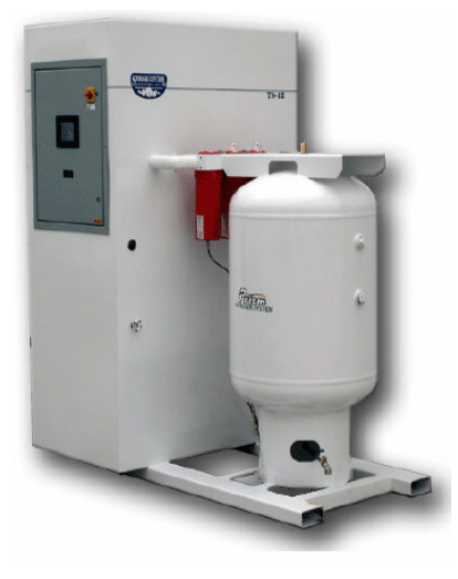
Fig. 3. Nitrogen generator from vaporized liquid nitrogen