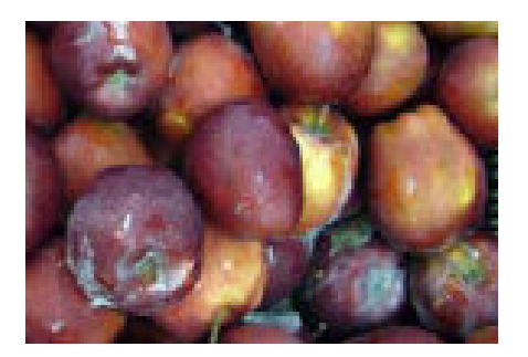
Fig. 5. Apples stored without using automatic systems

Instead of storing fruits and vegetables in N_2 than in CO_2 keeps a higher vitamin C content, but in both cases the decrease of vitamin C content is insignificant. Also fruits and vegetables firmness and taste significantly decreases gradually towards the end of the storage period but as well as in the vitamin C case the products stored under N_2 atmosphere maintains its high quality and firmness longer than those stored in CO_2 .