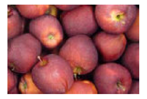
Fig. 6. Apples stored in automatic warehouses with controlled atmosphere

In Figures 5 and 6 there are illustrations of apples, variety Red Delicious which where stored almost 200 days. The first lot of apples which are shown in Figure 5 had been stored in a warehouse without any controlling or adjustment system. In the other figure, a modern warehouse was used which had climacteric control and monitoring systems and also an efficient Carbon Dioxide Scrubber.