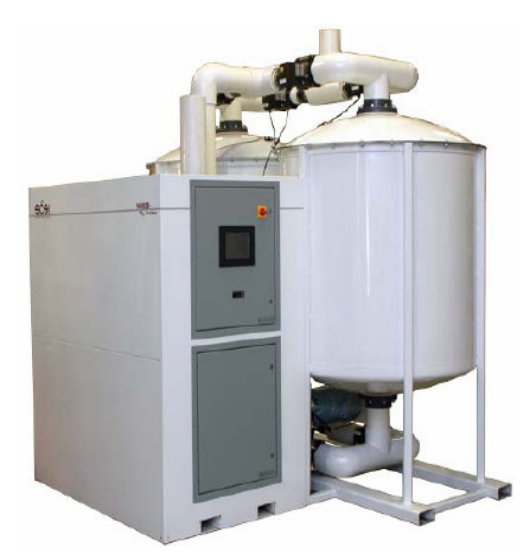
Fig. 2. Carbon dioxide scrubber

history of cycles per day in a room, scrubber capacity ratio and alarms. This system has a high efficiency rate because it assures a 99.9% gas purity, but unlike the system presented before, this one (Figure 2) decreases the CO<sub>2</sub> content to 2.5%.