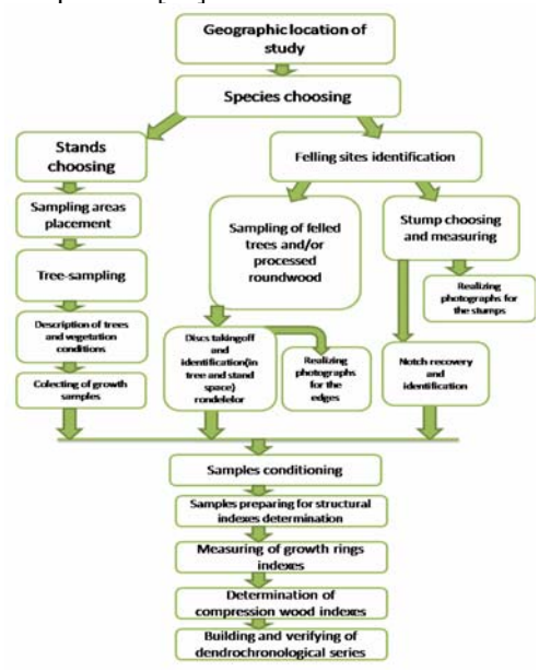
Fig. 1. Material selection and preparing for dendrochronological investigations

SITE LOCALIZATION. For dendroclimatic rebuilding of multiannual dynamics of air masses movement using compression wood, there are preferred sites presenting strong wind phenomena indicators, usually located at the upper limit of forest vegetation or on the oceanic coasts. Aeolian events dating is also in forest stands (presenting possible optimum ecological conditions) but it becomes more difficult due to the wide range of factors which influence the subjects ontogenesis, especially those inter and intra-species involved in competition [19].