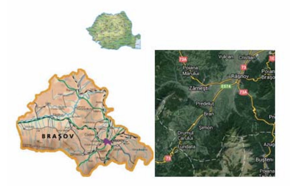
Fig. 1. Research location

Using an AutoCAD program there have been determined all these elements, taking into account the characteristics of the studied area [6], [7]. It specified that, for determination of the runoff coefficient concentration time, as well as to calculate other hydrological indicators, the Hydrology module extension of AutoCAD program is required.