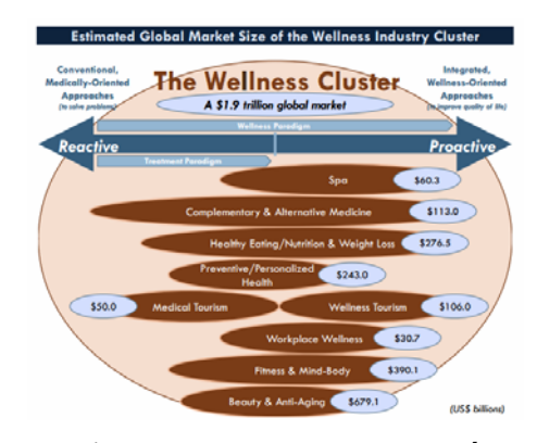
Fig. 2. Wellness Industry Cluster<sup>5</sup>

In order to identify the opportunities that led to the expansion of the wellness-spa industry, the institute for researches SRI International developed a model of group analysis (Cluster Analysis) for the wellness industry.