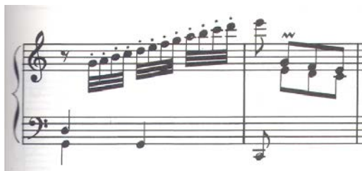
Fig. 4. P. A. Soler – Sonata no. 91 , bars 5-6 Soler, Sonatas para instrumentos de tecla , vol.VI

The cadence that concludes the first section of the sonata reminds of a rather specific Iberian rhythmic approach, which proposes to highlight each half of the beat within the measure, and the associated melodic speech cultivates the ornaments on the fraction of the beat from the beginning of each metric unit (Figure 5).