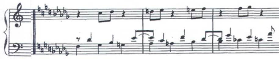
Fig. 13. P. A. Soler – Sonata no. 110, bars 75-77

syncofes superimposed with a melodic approach that, in the same way, emphasizes especially the unstressed beats of the 4-stroke measure (Figure 13).