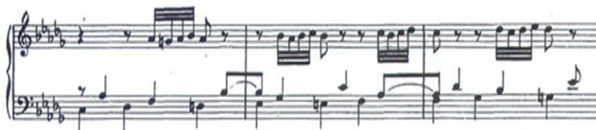
Fig. 12. P. A. Soler – Sonata no. 110, bars 41-43

Ornaments also survive in the following, as thematic, motif fragments, which retain the same appearance of temperamental musical discourse, especially as these thirty-two-halves formations are found in the unstressed sections of the unstressed beats within the measure (Figure 12).