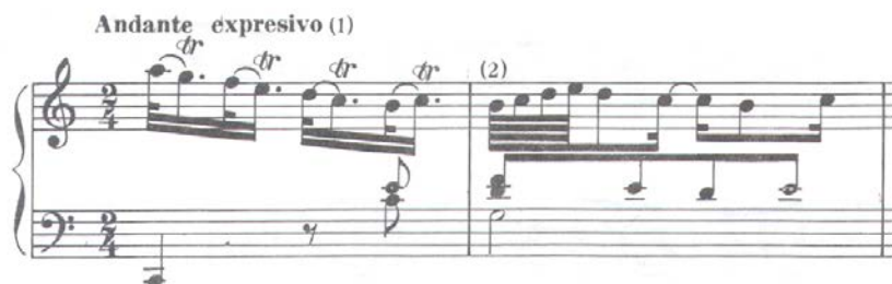
Fig. 2. P. A. Soler – Sonata no. 66, bars 1-2

The discourse from the beginning of sonata no. 66 of the fourth volume of sonatas is marked by the strong tendency to decorate the melody in the specific Iberian style. The trill - in a manner characteristic of the space in which Soler lived and created - is associated in this framework: the trill highlights the second value of a formula with unequal values - the longest value, the second of them - thus combining the syncopé with the ornamental trill (Figure 2).