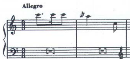
Fig. 8. P. A. Soler – Sonata no. 106 , bars 1-2

The initial rhythmic writing becomes more complex with the intervention of the second voice, in which the more temperamental dance style, characteristic of Iberian music, can be explicitly observed from this point of view, in the following example (Figure 9).