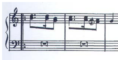
Fig. 9. P. A. Soler – Sonata no. 106 , bars 51-53

Sonata no. 110 of volume 7 proposes a central section that is made up precisely based on the support of a denser accompaniment, consisting of the repetition of three chords, which remind the chords of the guitar accompaniment specific to the peninsular sound art (Figure 10).