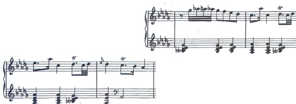
Fig. 11. P. A. Soler – Sonata no. 110, bars 31-34

Iberian characteristic is the melodic aspect that accompanies these metric-rhythmic-harmonic coordinates: the melody is ornamented, articulated on the basis of lesser values, which justifies us to argue a discourse that is claimed directly from the Spanish folk art mode (Figure 11).