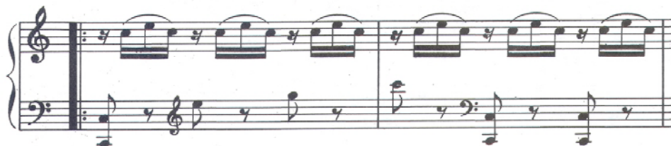
Fig. 1. P. A. Soler – Sonata no. 61, bars 49-50, Soler, Sonatas para instrumentos de tecla, vol.IV

The castanets are suggested by a harmonic complementary language, in which one of the voices signals only the main pulse, highlighting each beat, and the other voice - the upper one - completes the beat by singing other sixteenth values. (Figure 1).