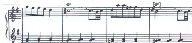
Fig. 15. P. A. Soler – Sonata no. 116, bars 21-24

Also, the preference is observed for maintaining an accompaniment reminiscent of the guitar chords, this time the chords being replaced with simple harmonic intervals that outline a discourse with powerful metrical, dancing metro-rhythmic meanings (Figure 15).