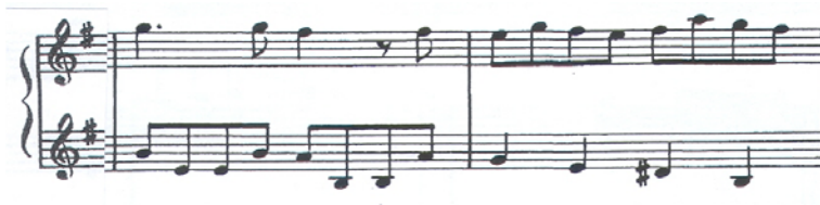
Fig. 7. P. A. Soler – Sonata no. 106 , bars 2-3 Soler, Sonatas para instrumentos de tecla , vol.VII

In sonata 106 of volume 7 we can find a special mixing between the melodic and the rhythmic aspect, so that a certain asymmetry is created which highlights the second (unstressed) half of beats 2 and 4 of the 4-stroke measure (Figure 7).