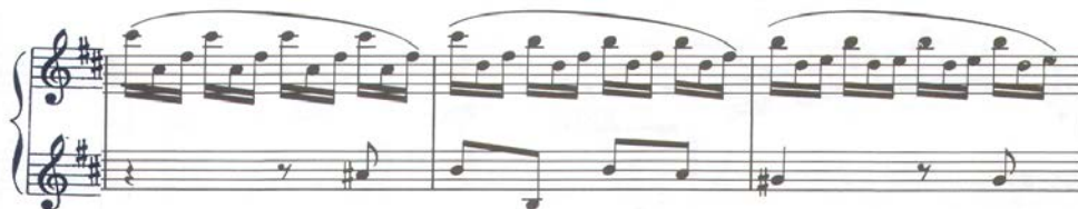
Fig. 6. P. A. Soler – Sonata no. 106 , bars 59-61

In addition to the rhythmic formulas made up of unequal, dotted values, we also note the case where exceptional rhythmic divisions are used, superimposed on the normally divided discourse, divisions that strengthen the impression of temperamental impetus. The example belongs to sonata 92 of the sixth volume (Figure 6).