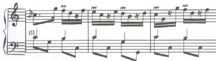
Fig. 5. P. A. Soler – Sonata no. 91 , bars 106-108

The cadence that concludes the first section of the sonata reminds of a rather specific Iberian rhythmic approach, which proposes to highlight each half of the beat within the measure, and the associated melodic speech cultivates the ornaments on the fraction of the beat from the beginning of each metric unit (Figure 5).