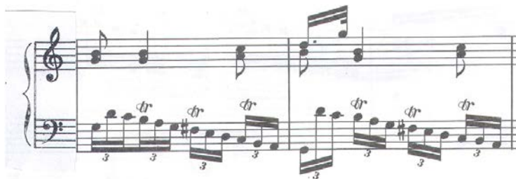
Fig. 3. P. A. Soler – Sonata no. 66, bars 27-28

The discourse is developed in the following measures, so that the elements already mentioned will be combined with the ascending diatonic passage or with the exceptional rhythmic divisions of triolet (Figure 3).