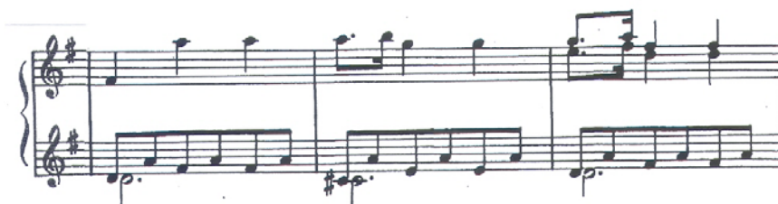
Fig. 14. P. A. Soler – Sonata no. 116, bars 35-37

The last of the sonatas analyzed in volume 7, the one with no. 116 , contains another type of discourse that may be close to the Iberian folk one. We find the composer's use of a latent polyphony within the accompaniment, a polyphony that highlights, through a longer sound, even the most grave voice, the one responsible for maintaining a pulse during beat 1 of each measure (Figure 14).