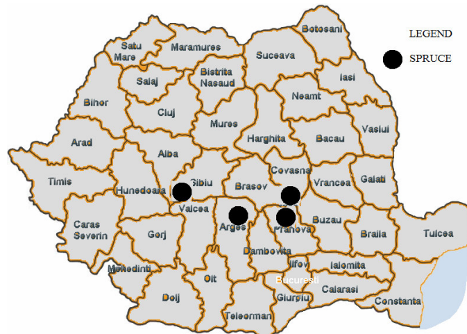
Fig. 1. Location of work points for common hornbeam and spruce

Măneciu the research took place in the Orăştii log yard. The map of the work points is presented in Figure 1.