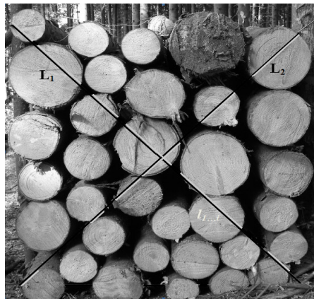
Fig. 3. Determination of the conversion factor of stacked wood in solid content by the method of diagonals

our country uses the method of diagonals (Figure 3).